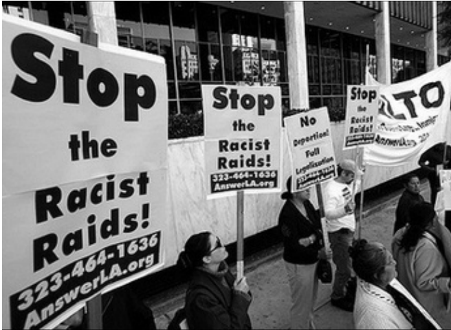
Latino activists protest the latest Immigration and Customs Enforcement (ICE) crackdown on employers who hire illegal aliens.

Light calls this dialectic “absorption and deflection.” As alternative immigrant-receiving regions in turn absorb immigrants to the point of “poverty intolerance” they too gravitate toward policies of “deflection.” The author labels this process “sequential absorption and deflection,”