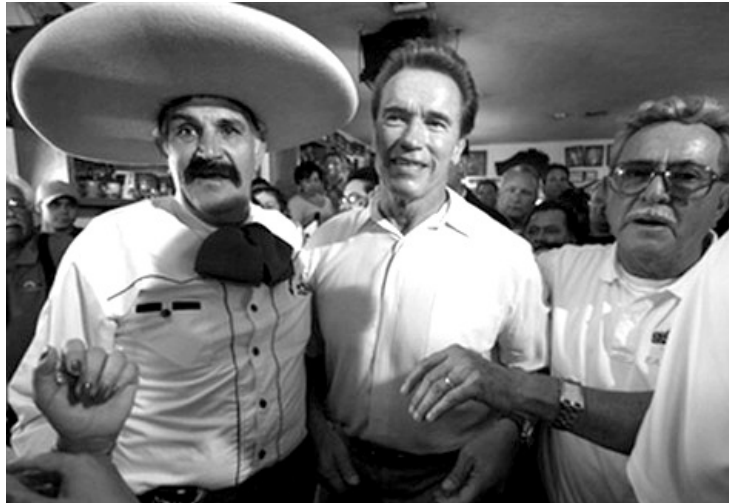
California Gov. Arnold Schwarzenegger is increasingly accomodating toward immigrant interests.

The policy of deflection is probably a one-time event for LA, unlikely to happen again because of the Latino’s capture the LA mayoralty and growing clout in the state legislature. Mayor since 2005, Antonio Villaraigosa seems more accommodating to immigration. In 2007 he pushed a city referendum on a $1 billion bond issue (Measure H), to be repaid with a tax on homeowners, to increase affordable housing. The referendum failed, but only because it fell just short of the required two-thirds