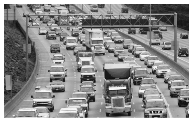
Population increases and demographic shifts lead to suburban sprawl, which creates transportation gridlock on America's roads.

heavy toll on congestion toll plans. Bloomberg's proposal faces an uphill battle in the state legislature. Trucking unions oppose the plan, and suburban politicians are generally unwilling to support a plan that would place a daily charge on many of their constituents. The Mayor's pledge to increase mass