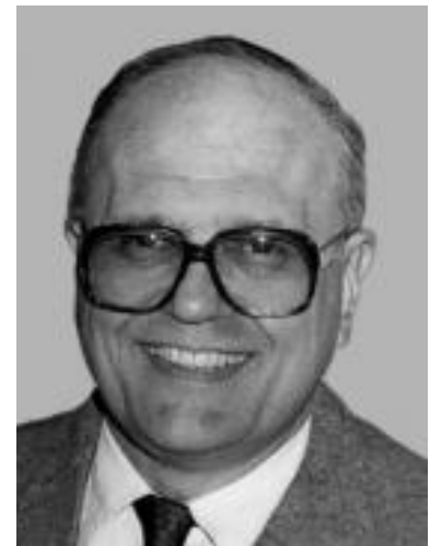
Rep. John Dingell stated that the 1965 “makes no change whatsoever in the safeguards of our present immigration laws....”

“...this bill is but a step in the right direction. It is estimated that in the total 5-year period 679,663 of the 828,805 persons entering the United States will come from Europe.” (HR Book 2, p. 420) ■