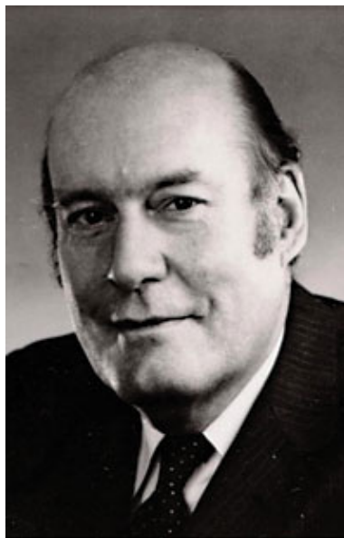
Former Att. Gen. Nicholas Katzenbach argued that the 1965 Act was "not designed to accelerate the number of newcomers permitted to come to America."

"This bill is not designed to increase or accelerate the number of newcomers permitted to come to America... this bill would retain all the present security and health safeguards of the present law... the overall effect of this bill on employment would, first of all, be negligible, and second, that such effect as might be felt would not be harmful, but beneficial. The actual net increase in total immigration under this bill would be about 60,000. Those immigrants who seek employment are estimated at a maximum of 24,000. Our present labor force, however, is 77 million. Statistically or practically, we are talking about an infinitesimal amount; 24,000 is about three one-hundredths of 1 percent of 77 million a good part of even these 24,000 additional workers would not even be competitors for jobs held or needed by Americans. I would expect very little change in the immigration from the Western Hemisphere." (Senate Part 1, Book 1, pp.8, 13-14, 31)