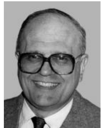
Rep. John Dingell stated that the 1965 “makes no change whatsoever in the safeguards of our present immigration laws....”

“...this bill is but a step in the right direction. It is estimated that in the total 5-year period 679,663 of the 828,805 persons entering the United States will come from Europe.” (HR Book 2, p. 420) ■