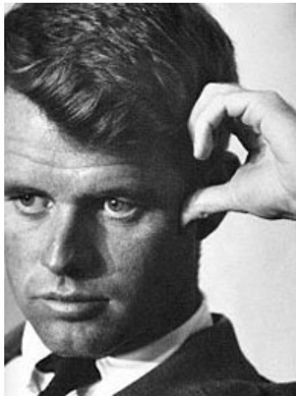
Sen. Robert F. Kennedy reassured his constituents that the 1965 Act would “have no significant effect on the ethnic balance of the United States.”

the demand...we bar immigration by individuals who have demonstrated that they do not hold such allegiance [to our fundamental precepts of political freedom and democratic government].... If it is true