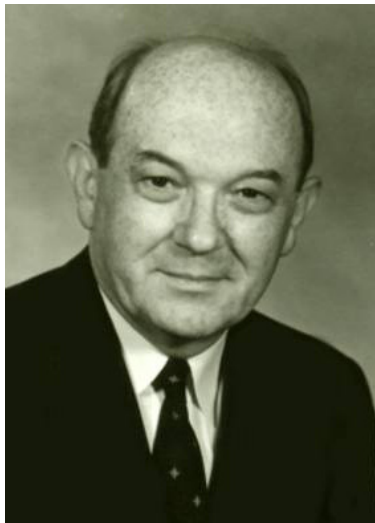
Former Secretary of State Dean Rusk argued that the 1965 Act “gives preferences to certain types of people in terms of training and talent.”

“This bill [HR 2580] itself draws some distinctions in favor of, gives preferences to certain types of people in terms of talent and training. It is not one which others have objected to. We haven’t had any indication of disagreement on that from abroad, from any government, certainly.... We are dealing here with a level of immigration that is fully within our ability to absorb, and our needs as a Nation to receive...we do not get the impression that 3 billion people are all at the starting line, waiting to take off to come to this country, just as soon as the bill is passed.” (HR Book 1, pp. 97, 105, 105)