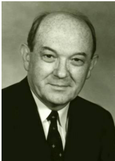
Former Secretary of State Dean Rusk argued that the 1965 Act “gives preferences to certain types of people in terms of training and talent.”

“This bill [HR 2580] itself draws some distinctions in favor of, gives preferences to certain types of people in terms of talent and training. It is not one which others have objected to. We haven’t had any indication of disagreement on that from abroad, from any government, certainly.... We are dealing here with a level of immigration that is fully within our ability to absorb, and our needs as a Nation to receive...we do not get the impression that 3 billion people are all at the starting line, waiting to take off to come to this country, just as soon as the bill is passed.” (HR Book 1, pp. 97, 105, 105)