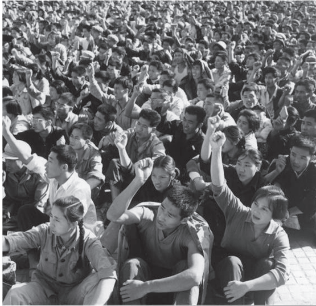
Red Guards in 1966 helped propagate Mao’s “Cultural Revolution.”

The problem is that people are not and never will be equal. Biology is not the totality of destiny—no competent behavioral geneticist believes that, although plenty of incompetent sociologists contend that heredity is meaningless—but it certainly sets limits. No amount of sermonizing can create equality. But have-nots do have their uses. Robespierre’s Paris mob fed the guillotine with chants of “ liberté, égalité, fraternité. ” Bolsheviks murdered the Russian aristocracy in the name of the proletariat. And Mao loosed rampaging Red Guards on reluctant converts to his Cultural Revolution.