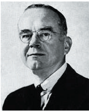
Author James Burnham

Authentic conservatism [draws] a firm and clear distinction between love of or attachment to the country, on the one hand, and deference to the state or the incumbent masters of the state, on the other. Especially