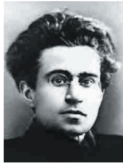
Marxist Antonio Gramsci