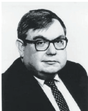
Author Sam Francis

And yet he was right; nations are distinct and different—and all distinct peoples have a right to exist and to perpetuate themselves, the people of the West included. Denial of this right borders on genocide—even if the abridgement is less overt than mass murder. Unlimited immigration will secure the same end, albeit more slowly. Garrett Hardin called this passive genocide . “It may be that no one is ever killed; but the genes of one group replace the genes of the other .” [Emphasis added.] This says nothing negative about anyone else; all are entitled to continued existence and prosperity to the degree that they have the capability to achieve it.