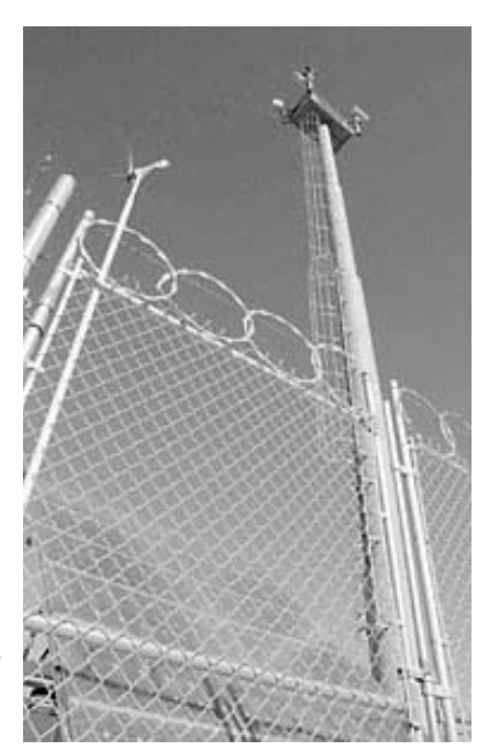
High-tech security fences enhance border security.

While Jean Raspail has said of France's colonization by the Third World, "The deed is done," Buchanan is not quite as pessimistic. Buchanan argues that we have one "last chance" to save our country and civilization, before the rising political clout of Latinos will make any positive legislative changes impossible.