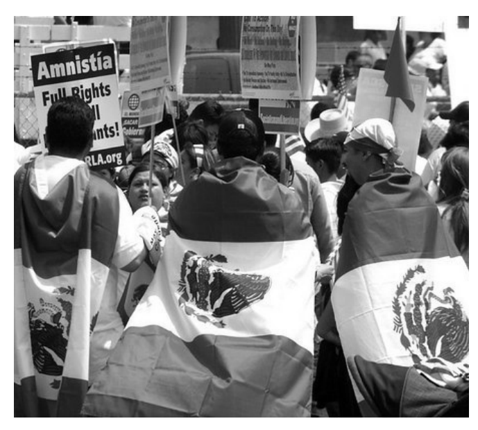
In 2006, Latino protestors clog the streets of Los Angeles in massive demonstrations.

claim. He speaks with compassion about the negative effect that immigration has on African Americans. He does not see America as just a white nation, but approves of the French writer Hector St. John De Crevecoeur's assessment that "[In America,] individuals of all nations are melted into a new race of men." Neither Buchanan, nor Crevecoeur meant this in universalistic terms of a "new Soviet man" or "new global democratic man," but rather as a people who have a unique and distinctive culture rooted in, but distinct from Europe and more specifically Great Britain. As Buchanan puts it bluntly: "Language, faith, culture, and history—and, yes, birth, blood, and soil—produce a people, not an ideology."