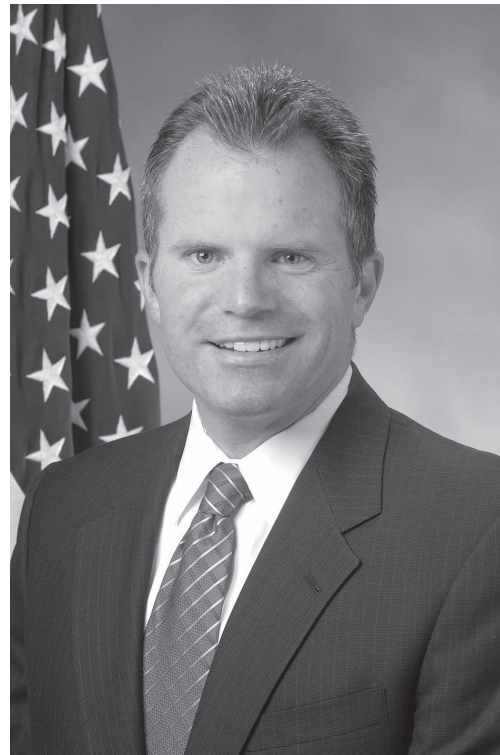
Michigan Attorney General Mike Cox

Over objections from various “immigrant rights” lobbyists and liberal legislators, in December 2007, Cox issued a formal attorney general’s opinion ending Michigan’s practice of granting driver’s licenses to illegal aliens.