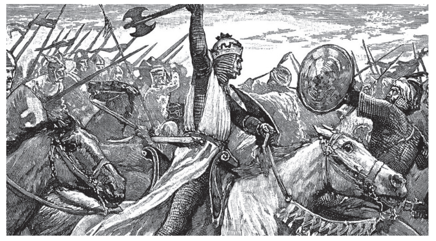
In 732, the Frankish king Charles Martel defeated Muslim invaders who sought to claim Europe for Islam. However in recent years, European elites have welcomed the descendants of the invaders, even though Islam has never rescinded its command to convert the whole world to the religion and totalitarian political system.

The big lie from elites to the population about the nature of Muslim immigration has been dangerously undermining to democratic governance. European lead-