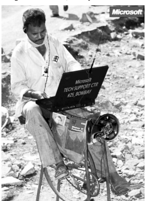
Global Support Centre Employee of the Month

consumers in the form of reduced prices. Most of the value added via offshore research and development (R&D) and manufacturing is retained by economic elites who are the owner class of these multinational firms. A complementary policy goal of the economic elites was to dismantle the U.S. tariff system that served to protect U.S. industries and careers from being undercut by cutthroat foreign competition, which tends to control costs by ignoring regulations that protect the environment and U.S. employment civil rights policies.