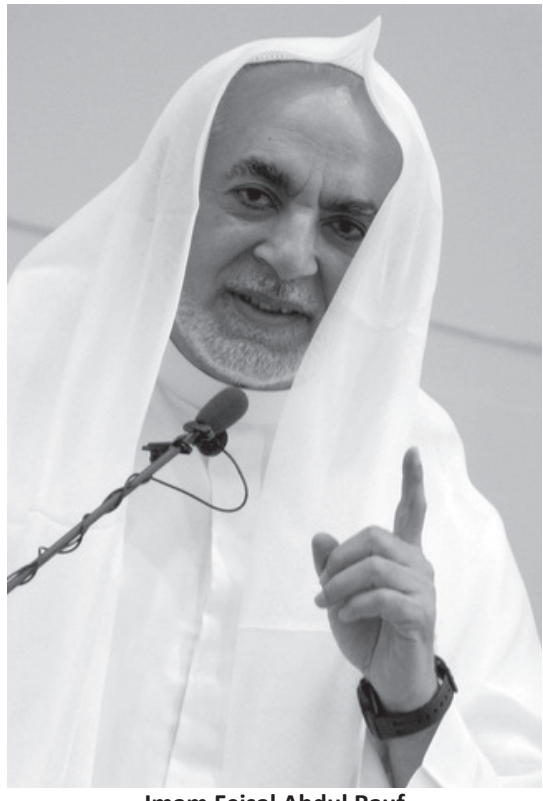
Imam Feisal Abdul Rauf

Furthermore, Islamic doctrine "permits the marriage of pre-pubescent girls. There is no minimum age for a marriage contract and consummation may take place when the girl is age eight or nine." As Nonie Darwish has written in Cruel and Usual Punishment , "the great majority of Muslim women are among the poorest and most oppressed in the world." From the sartorial prison of the burqa to the fact that a woman may never be in the physical presence of a man other than her husband or close blood relative, Muslim women are held hostage to [sharia] law. Rebellious women end up under house arrest, beaten or dead.