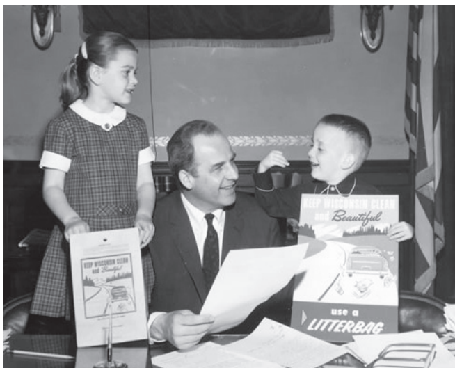
The late Gaylord Nelson (left), the principal founder of Earth Day, served as the 35th Governor of Wisconsin (1958-1962) and U.S. Senator from Wisconsin (1963-1981). In an interview with the Milwaukee Journal Sentinel , April 22, 2001, Nelson said, “The bigger the population gets, the more serious the problems become.... We have to address the population issue. The United Nations, with the U.S. supporting it, took the position in Cairo in 1994 that every country was responsible for stabilizing its own population. It can be done. But in this country, it’s phony to say, ‘I’m for the environment but not for limiting immigration.’”

Additional reading? A short piece along these same lines — The Globalist Copout , published in 2000 — contained my first public challenge to ESA on this issue (at http://www.thesocialcontract.com/cgi-bin/showarticle.pl?articleID=672&terms= ). A recent analysis titled Environmental Voting Records of Members of the U.S. Congress, 2006 will shed further surprising light on who is working with us and who against us (at http://www.sci.sdsu.edu/salton/CEV2006.pdf ). And for historical understanding, nothing beats The Environmental Movement’s Retreat from Advocating U.S. Population Stabilization (1970-1998) (at http://www.numbersusa.com/about/bk_retreat.html ). Estimates of population growth to 2050 under different immigration legislation options are given in Projecting the U.S. Population to 2050: Four Immigration Scenarios (at http://www.fairus.org/site/DocServer/pop_projections.pdf?docID=901 ) ■