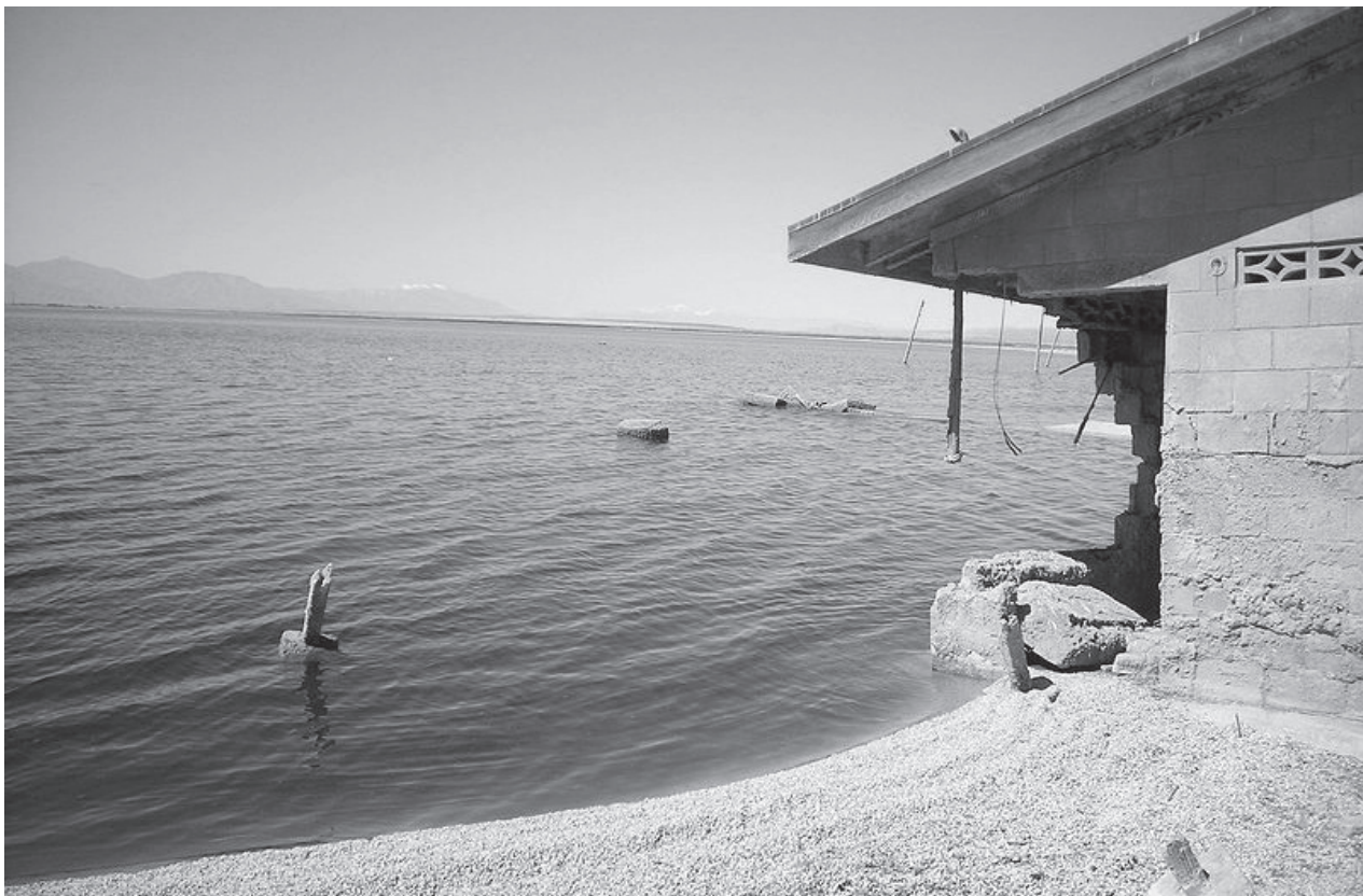
The eastern shore of the Salton Sea, California’s largest lake created by accidental natural causes in 1905.