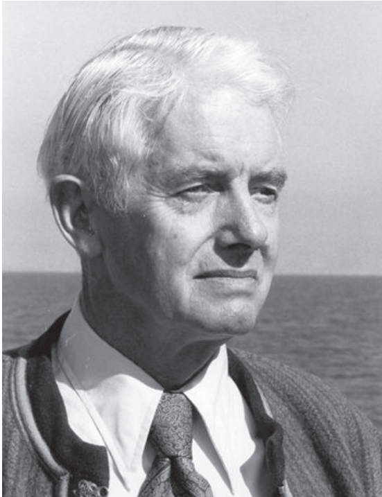
The late David Brower, an avid conservationist as well as founder and first executive director of the Sierra Club, resigned from the Sierra Club Board in 2000. "The world is burning and all I hear from them is the music of violins," he said.

We spent untold volunteer hours working to return the Club to its former sensible, environmentally appropriate positions. We gathered member petitions to qualify candidates for the Board of Directors and pose policy referendums for the membership's consideration in the annual Club-wide elections. We succeeded in getting several fine environmentalists elected to the Board, although our important population initiative of 1998 failed to make the cut.