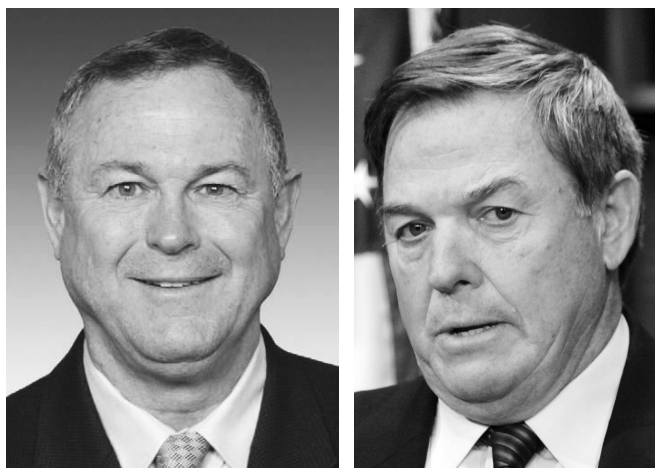
Rep. Dana Rohrabacher (R-CA) Rep. Duncan Hunter (R-CA)