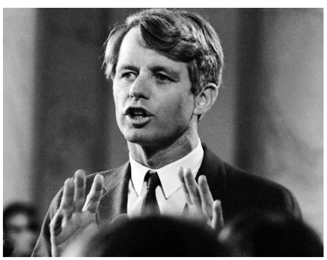
Sen. Robert F. Kennedy reassured his constituents that the 1965 Act would "have no significant effect on the ethnic balance of the United States."

for example, the net effect would be to increase the number of Italo-Americans by one-tenth of 1 percent of our population this year, and less as our population increases. Americans of Italian extraction now constitute about 4 percent of our population; at this rate, considering our own natural increase, it would take until the year 2000 to increase that proportion to 6 percent. Of course, S.500 would make no such radical change.