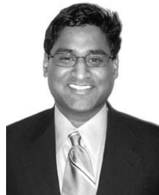
National Review's Ramesh Ponnuru

All these points could be reduced to one fact: the “comprehensive” approach has the dual effect of alienating white voters who would otherwise vote Republican, and creating more Hispanic voters who will vote for the Democrats.