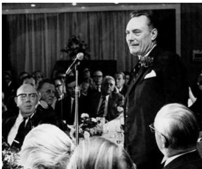
British statesman Enoch Powell’s landmark 1968 speech, often referred to as the “Rivers of Blood” speech, warned of the consequences of mass immigration for his fellow countrymen and noted that, “All I know is that to see, and not to speak, would be the great betrayal.”

At VDARE.COM, we exist to provide journalism on these problems because the MSM won’t. But in case anyone has forgotten, the problems include: crime; disease; destroyed schools; destroyed neighborhoods; congestion; racial friction; linguis-