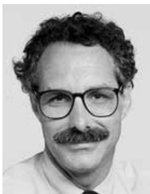
Syndicated Columnist Robert Samuelson

They had already lost everything. By the late 1990s, they were effectively excluded from the mass media and, especially after the disaster of the Bush clan’s recapture of the Republican Party in 2000, from all political expression. They