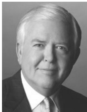
CNN Anchor and author Lou Dobbs

Exactly the same process has been underway among immigration reform patriots. The immense difference between immigration reform in 2006