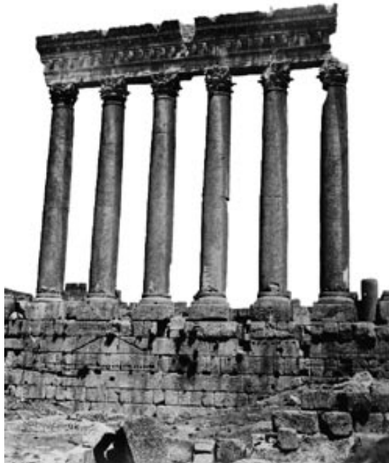
Will demographic trends—differential birthrates, ethnic diversity, and immigration—result in Lebanonization of the United States?

Palestinian refugees had started arriving in 1948 and sped up after the 1967 Six Day War. Then, in the “Black September” of 1970, King Hussein of