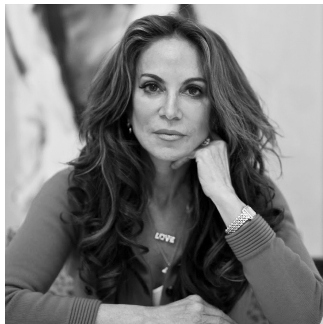
Frank Gaffney (left), president of the Center for Security Policy, and Pamela Geller (right), best-selling author and blogger.