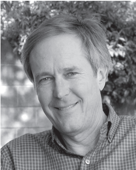
Atlantic National Correspondent James Fallows

For example, it may now be after-the-fact prescient to wonder if funneling extremely inflammable materials like methane from deep in the ocean might create risks that could result in a catastrophic ecological disaster. And it is less likely that a journalist would even think about what drives oil companies to spend ever more lavishly trying to get consistently less-productive sources of energy around the world, let alone making clear the consequences that must come with realization that all resources are limited in availability.