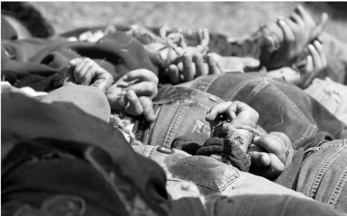
Drug-related violence in Mexico has cost 3,148 lives since 2008 according to the Reforma newspaper.

Furthermore, Mexico’s population continues to rapidly expand, along with a commensurate increase in demand for oil. Beck projects that “By 2014, a few short years from now, Mexico will no longer have excess oil to export. This calamity will be momentous!”