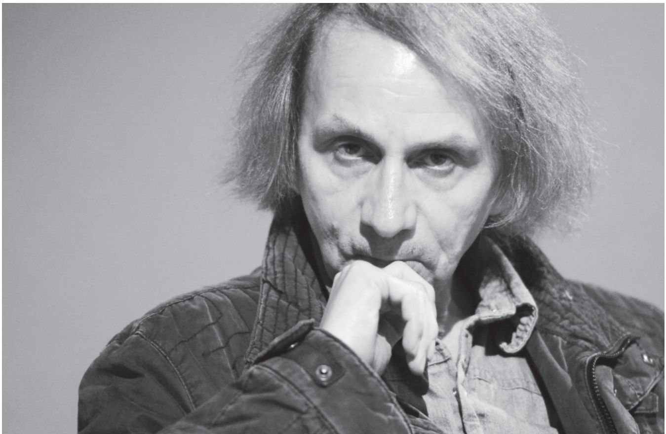
Submission author Michel Houellebecq

In an interview with The Paris Review , Houellebecq remarked, “I condense an evolution that is, in my opinion, realistic.” Events since the release of his novel bear witness to the truth of that. American readers will find much to reflect on here. ■