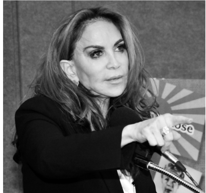
Pamela Geller points to an attendee during a question and answer session at an America's Survival conference at the National Press Club, February 5, 2013.

Much of the meat in Europe is processed as halal but is not labeled as such. 70 percent of New Zealand lamb imported into the United Kingdom is halal. When halal food was imposed on UK public schools in 2007, resounding public uproar ensued.