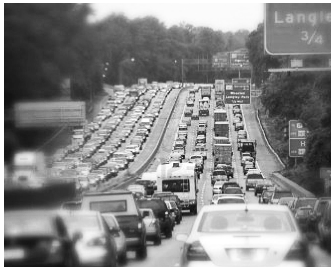
The interior of a redesigned Bay Area Rapid Transit (BART) rail car, which would accommodate throngs of San Francisco Bay Area commuters by having patrons stand and lean against padded sections rather than sit in seats (UPPER LEFT). Traffic congestion in the greater Washington, D.C. area (UPPER RIGHT) ranks among the 10 worst in the nation. According to INRIX’s National Traffic Scorecard Annual Report, motorists in the greater national capital region spend an annual average of 40 wasted hours stuck in traffic. Motorists in Los Angeles waste an annual average of 64 hours jammed in traffic (2013 data). Projected U.S. population growth, partially the result of a steady influx of immigrants, is expected to increase by 16.5 percent, from 310 million to over 360 million by 2030. http://en.wikipedia.org/wiki/Projections_of_population_growth