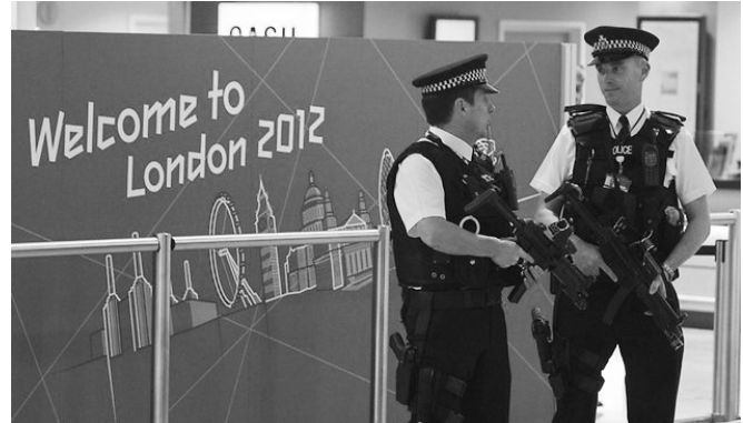
London of 2012 was a dangerously diverse place after years of Muslim immigration, and its Olympics required $2 billion in security as a result.

Americans' safety. In March, Sacramento proposed new standards for cabbies that suggested the drivers be made to show they can speak enough English to understand their passengers' desired destination. (Other requirements included that drivers should be "hygienically clean" and wear a collared shirt and slacks, so taxi diversity must be getting edgy there.) Remarks by readers on the CBS local website mentioned being taken to the wrong place, presumably because of inadequate English, although complaints about objectionable body odor predominated by far.