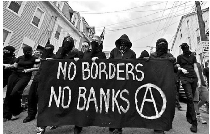
Masked anarchists in San Francisco express their disapproval of borders (ABOVE). In April 2013, open-borders activists descended upon Washington, D.C. with slogans like "No human is illegal" and "Migration is a human right" (LEFT).

The deck is strongly stacked against shutting down the foreign flood, but the most convincing argument for zero immigrants may well be rapid technological change in the workplace. As robotics and automation perform increasingly complex tasks, humans are being phased out of many jobs. (See my earlier Social Contract article, "Three Stakes in the Heart of the American Dream: