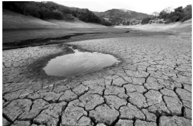
Almaden Reservoir, near San Jose, California, showed the effects of an extreme drought in the state, February 2014.

water has been pumped from underground aquifers that areas of land in California's Central Valley are sinking at an alarming rate, up to a foot per year in one tract. Not only is the subsidence another warning about limited supply, but the land sinkage also disturbs the proper functioning of water infrastructure around the state. Canals were designed with a precise degree of slope to move water by gravity, and the subsidence has disrupted that. A state hydrologist remarked, "We were surprised at the amount of land being affected."