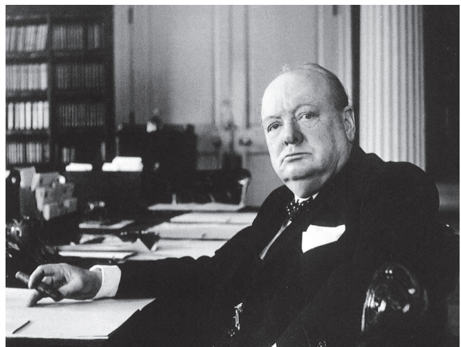
Sir Winston Churchill

—Sir Winston Spencer Churchill ( The River War, first edition, Vol. II, pages 248-50 (London: Longmans, Green & Co., 1899). ■