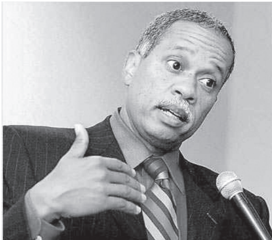
Former NPR correspondent Juan Williams

NPR correspondent Juan Williams was sacked, at the insistence of the Council for American-Islamic Relations (CAIR), for saying he felt nervous when he saw people in Muslim garb on airplanes. What would NPR have done to him if he called Muslims "destroyers of human kind," as did John Wesley, or described Islam as "as dangerous in a man as hydrophobia in a dog," as did Winston Churchill?