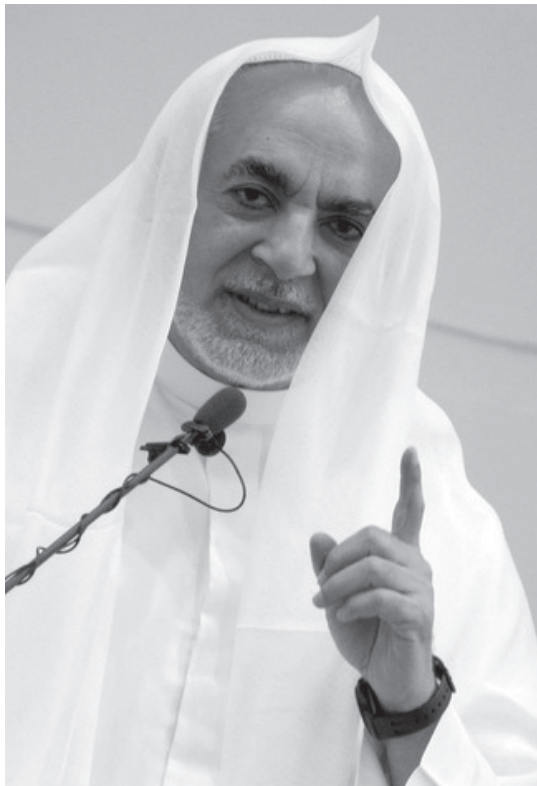
Imam Feisal Abdul Rauf