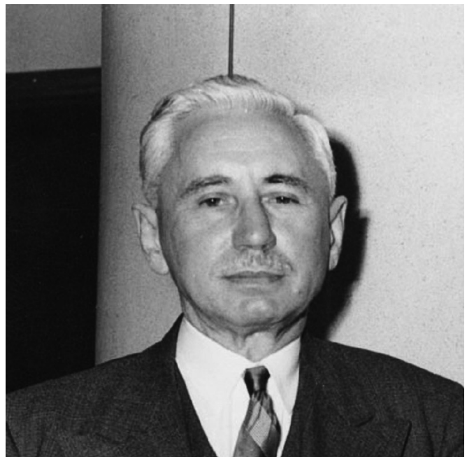
Will Durant, author of The Story of Civilization