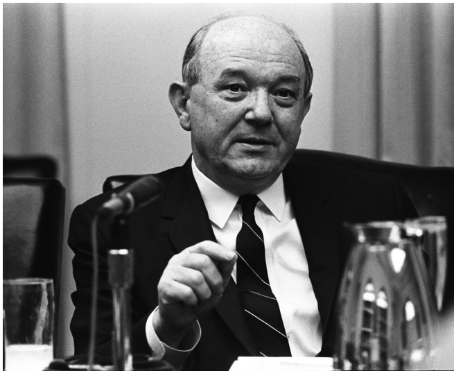
Secretary of State Dean Rusk

“This bill [HR 2580] itself draws some distinctions in favor of, gives preferences to certain types of people in terms of talent and training. It is not one which others have objected to. We haven’t had any indication of disagreement on that from abroad, from any government,