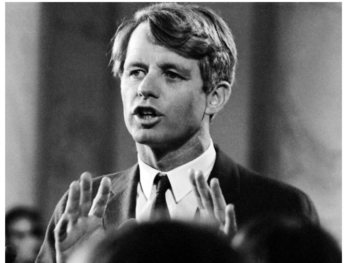
Sen. Robert F. Kennedy reassured his constituents that the 1965 Act would “have no significant effect on the ethnic balance of the United States.”

for example, the net effect would be to increase the number of Italo-Americans by one-tenth of 1 percent of our population this year, and less as our population increases. Americans of Italian extraction now constitute about 4 percent of our population; at this rate, considering our own natural increase, it would take until the year 2000 to increase that proportion to 6 percent. Of course, S.500 would make no such radical change.