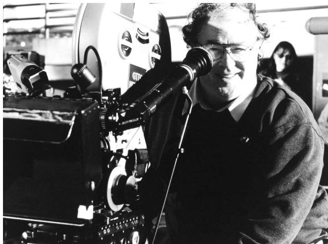
Director Bob Clark