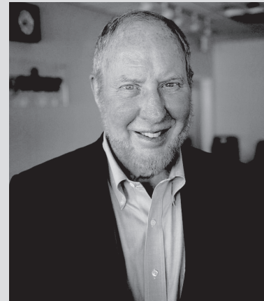
Harvard Professor Robert Putnam

"Less happiness and lower perceived quality of life." ■