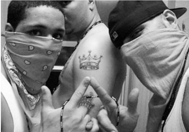
Latino gang members of the Latin Kings